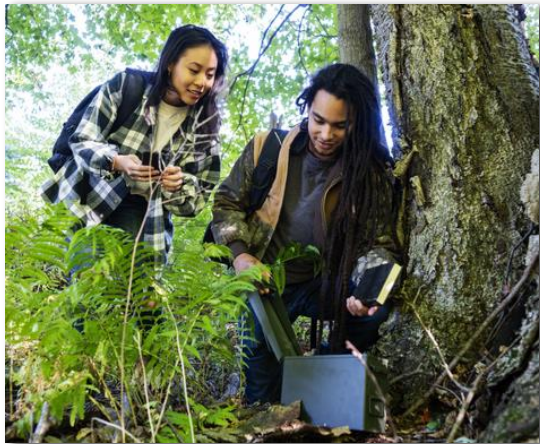
Some of the most exotic geocache locations are at the Eiffel Tower in Paris and on Deception Island, Antarctica.

On the Hunt On August 19, you can enjoy a little dose of discovery on International Geocaching Day. Geocaching is a modern-day version of treasure hunting. Individuals hide their “treasure,” the geocache, at any location they choose. The cache’s GPS coordinates, often with a description of the environs, are then posted to a website. Using these details, it is up to the treasure hunter to track down the cache. This popular pastime began in 2000, when computer consultant Dave Ulmer hid a bucket in the Oregon woods,