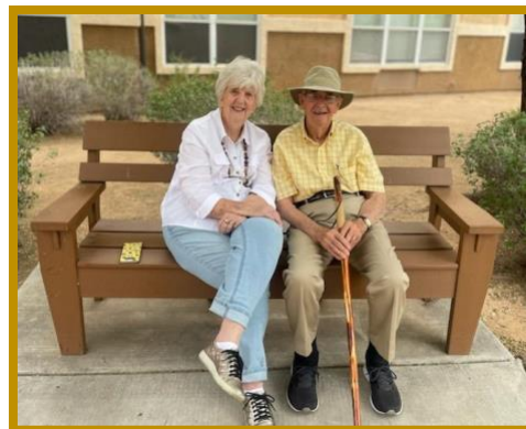
Looking Back in August