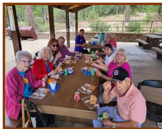
The Lodge enjoying a wonderful picnic in Mt. Lemmon