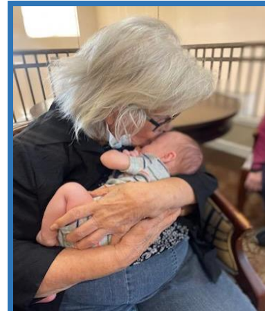
Great grandma meeting her great-grandson for the first time.