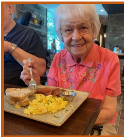
Enjoying a delicious breakfast at First Watch