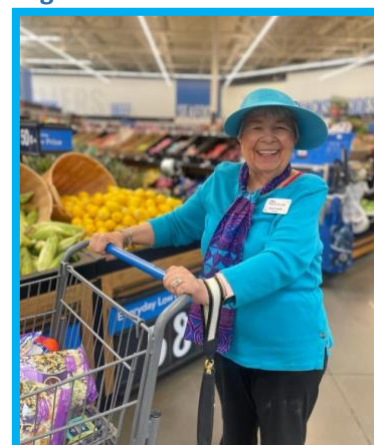
We love our shopping!