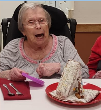
Gingerbread House Fun