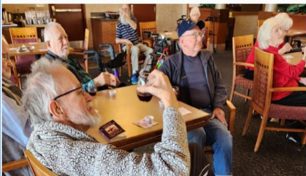
WINE AND CHOCOLATE TASTING