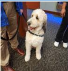
THANK YOU SANTA!!