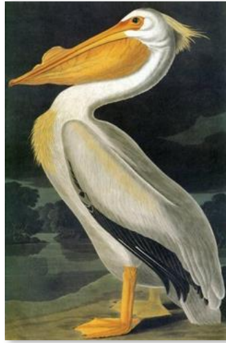
The primary medium Audubon used for his paintings was watercolors.

John James Audubon, namesake of the bird conservation organization the Audubon Society and French American painter of birds, was born on April 26, 1785, a date now celebrated as Audubon Day.