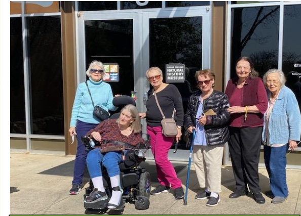
Fascination and Education