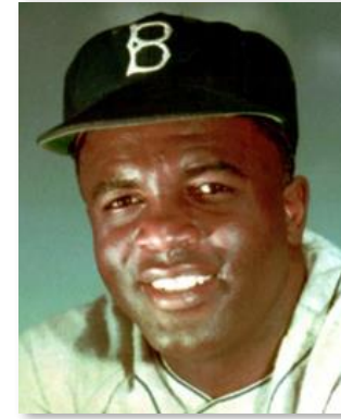
Robinson was only 53 when he died.

On April 15, 1947, Jackie Robinson played his first major league baseball game with the Brooklyn Dodgers against the Boston Braves in front of a crowd of 25,000 spectators at Ebbets Field in Brooklyn. This marked the first moment that an African American athlete played a sport in any of the major leagues.