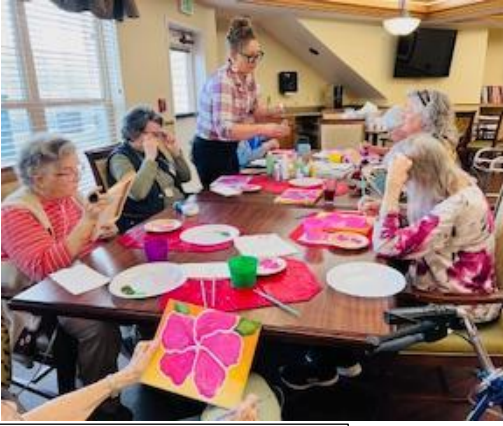
This month's hibiscus painting brought everyone together in a swirl of creativity, capturing the vibrant beauty of the tropical blossoms in a shared artistic journey.