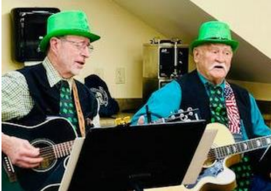
Our Singing cowboys came and sang for us during our Party.