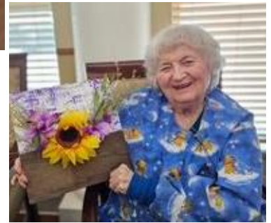
Our craft brought creativity to life as we designed vibrant and unique pieces, adding a personal touch to brighten and beautify our shared space.