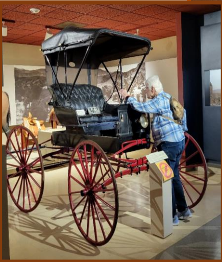
Taking a step in time- Our residents enjoying the vintage carriages at the History Museum