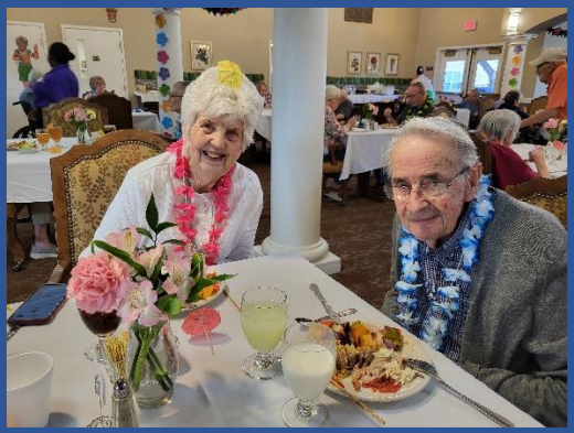
Good Food, Good Friends, Good Vibes Luau Style!