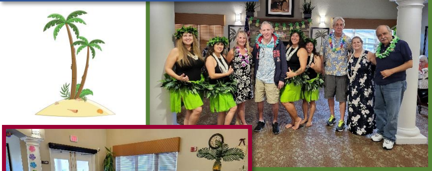
Aloha spirit shining bright with our Hula friends