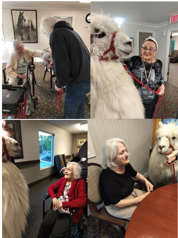
Visit from the Easter Bunny