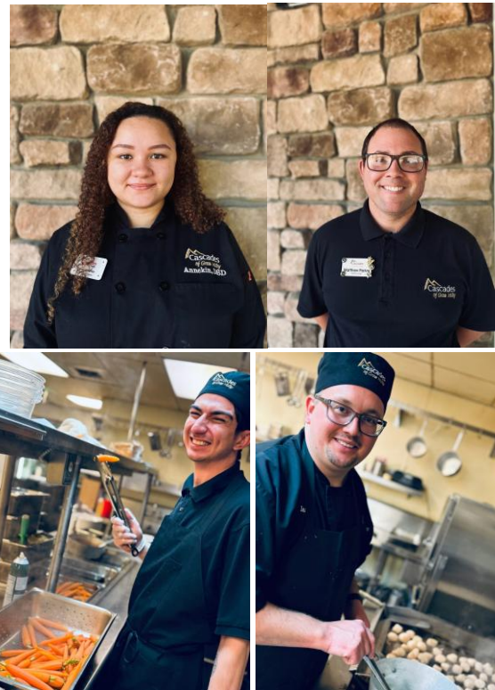
(not all dining staff pictured)

We are grateful for our excellent dining service team, who selflessly serve our community, providing sustenance for our bodies and warmth for our hearts.