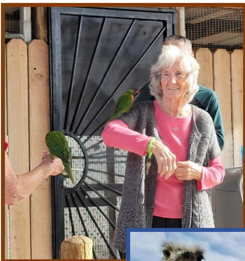
We had a great time at the Rooster Cogburn Ostrich Ranch!