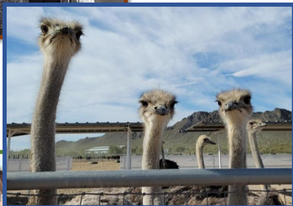
Did Someone Say Snack Time?!