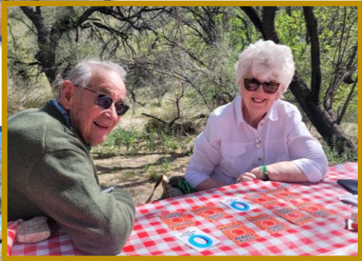
Enjoying a wonderful picnic with friends at Colossal Cave Park