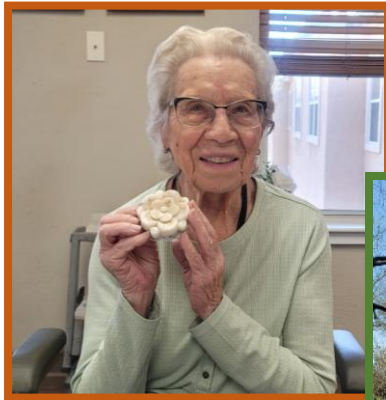
We had a wonderful time making homemade lavender, oatmeal bars of soap!