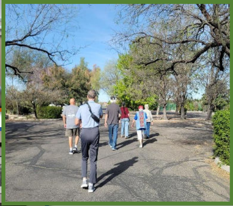
Steps, smiles and fresh air with our Walkers Club!!