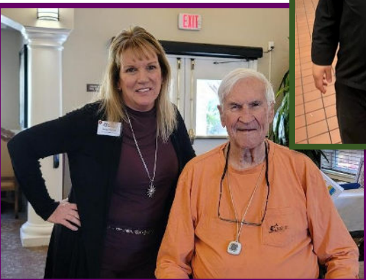
We're so grateful for our wonderful staff who make every day brighter for our residents!