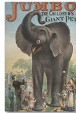
After his death, Jumbo’s skeleton was displayed at the American Museum of Natural History.