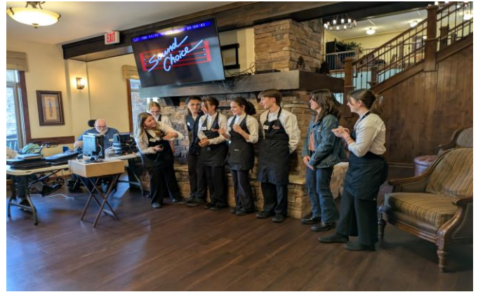
A group of our wonderful servers performing a song together at Karaoke one Friday afternoon.