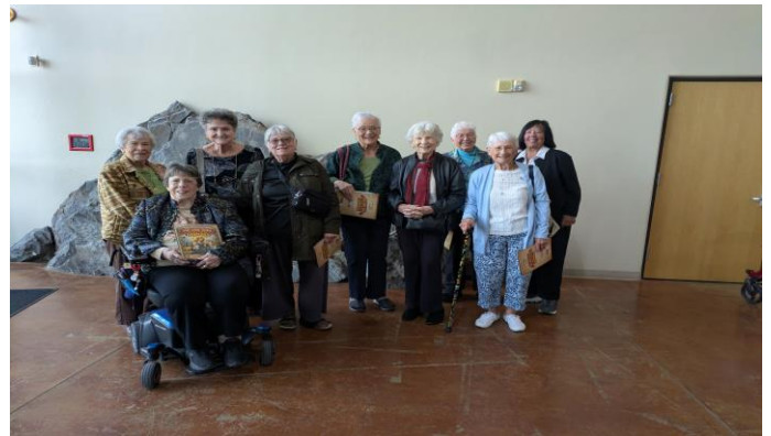
This group went to the Rock Church to see the musical, "The Girl who Spoke with Animals."